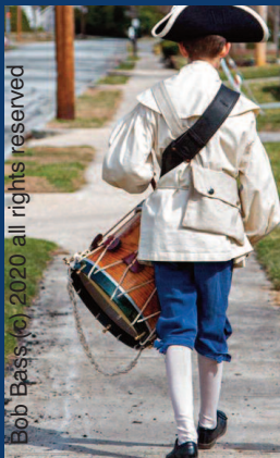
Bob Bass (c) 2020 all rights reserved